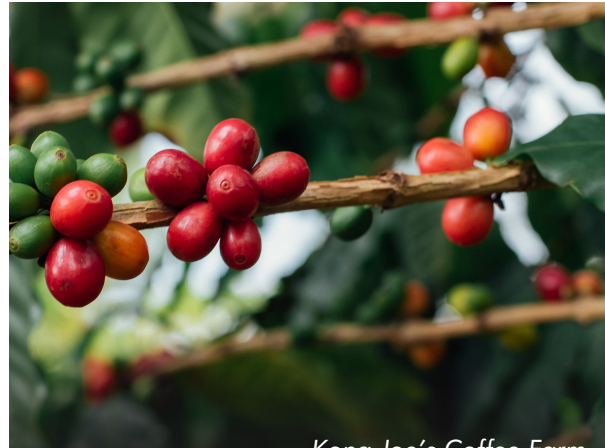
Kona Joe's Coffee Farm